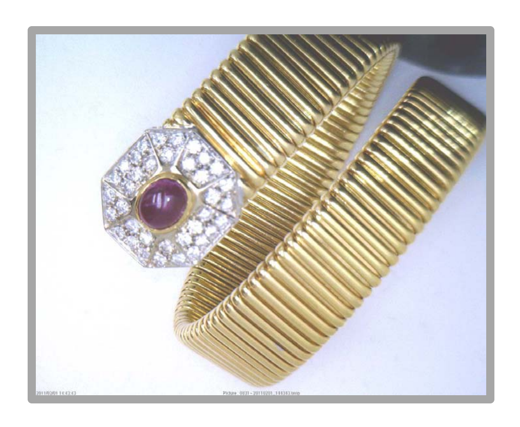
Bulgari,18 karat diamond and ruby flexible bracelet

Represented by <u>Tri-State</u> <u>Antiques</u> Booth 1618